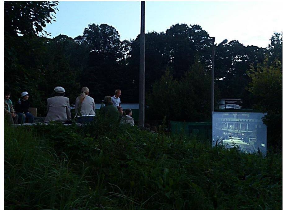
Open-air cinema in Juhkentali - August 2013