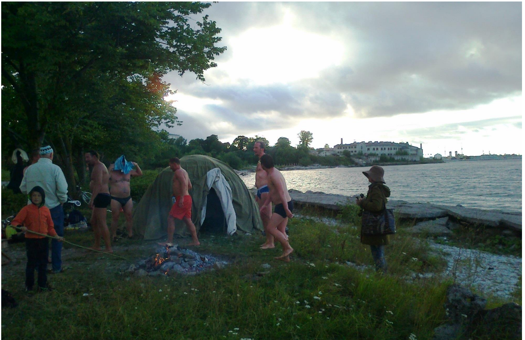
Sauna party in Kalarand to mark the perfect spot for a public sauna – August 2013