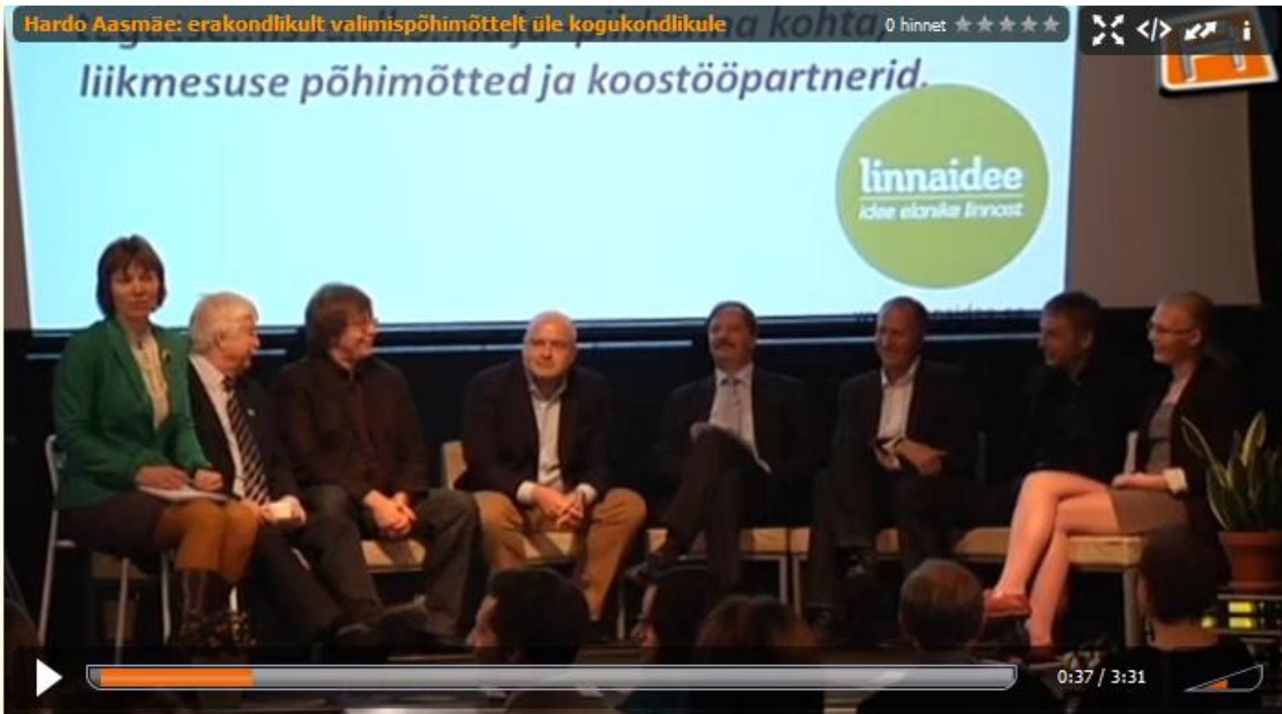
Press conference with the mayor candidates on 12.10.2013