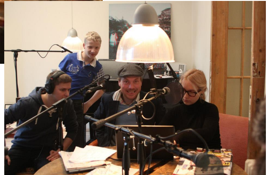
Self-initiated library and community space as well as the monthly radio day of Uus Maailm neighbourhood