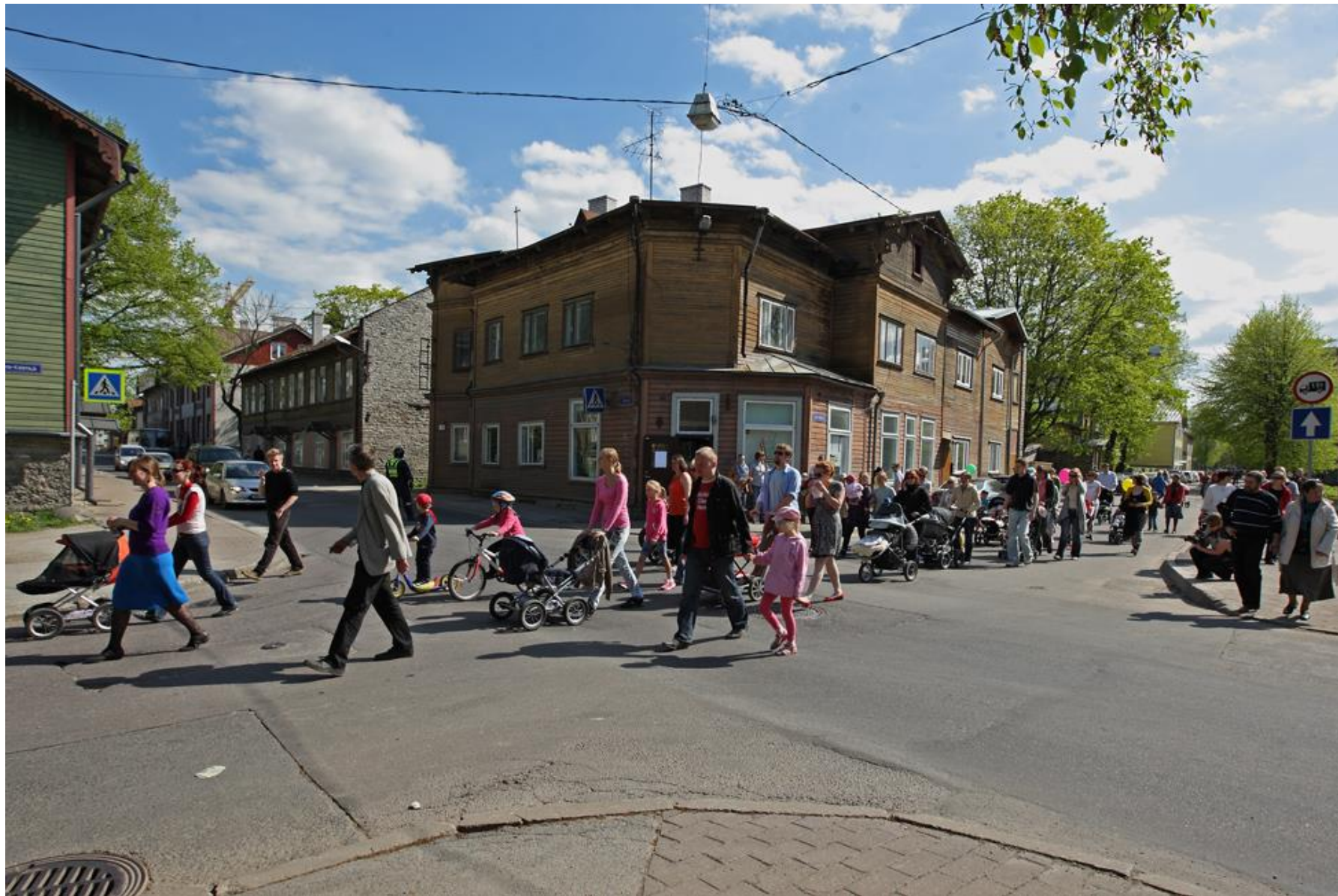
Baby pram ride in Kalamaja to mark the dreamed pedestrian street between the Old Town and the seaside - May 2012