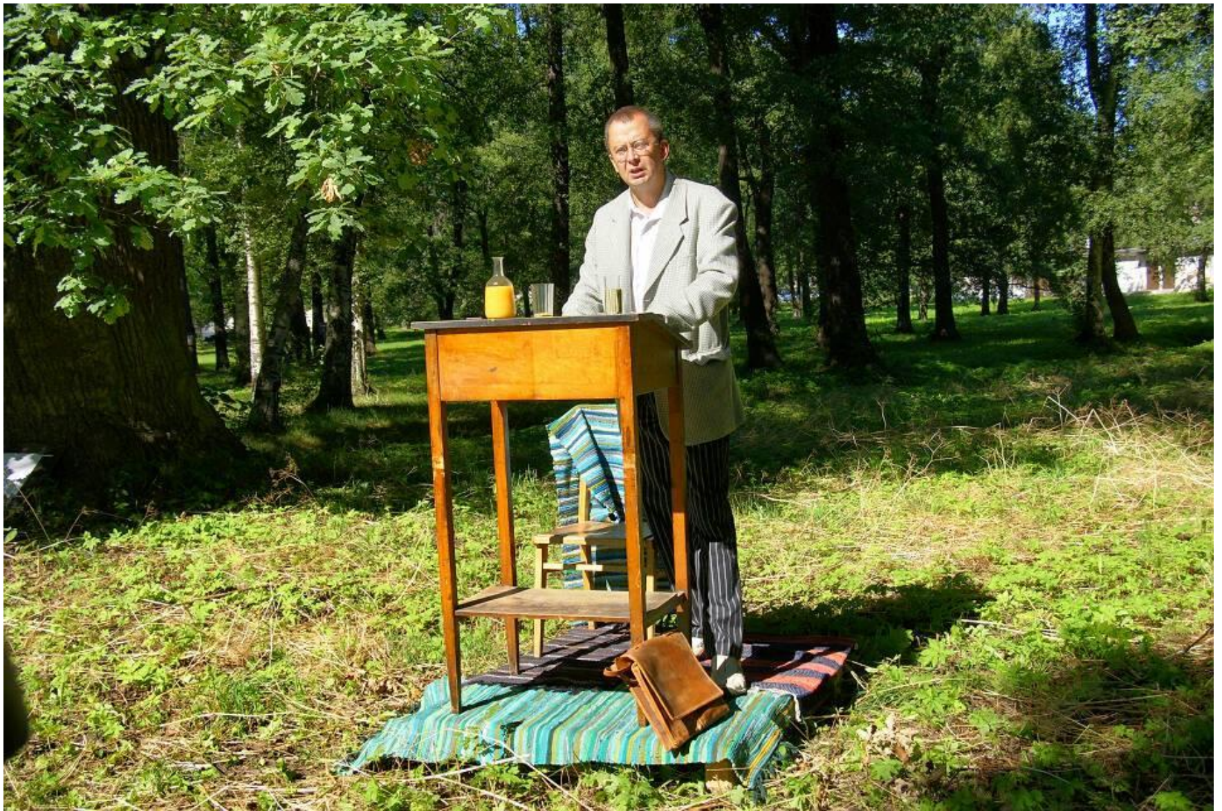
Fun day of the Professors' Village neighbourhood in Kopli - August 2013