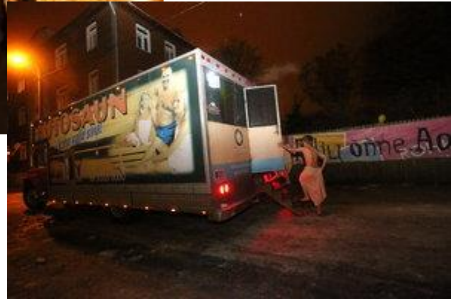
Celebrating Ao street's 80th birthday in Kassisaba - February 2013