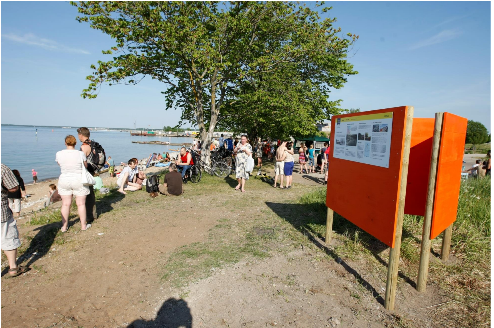
Kalarand beach party on a private contested development area - June 2011