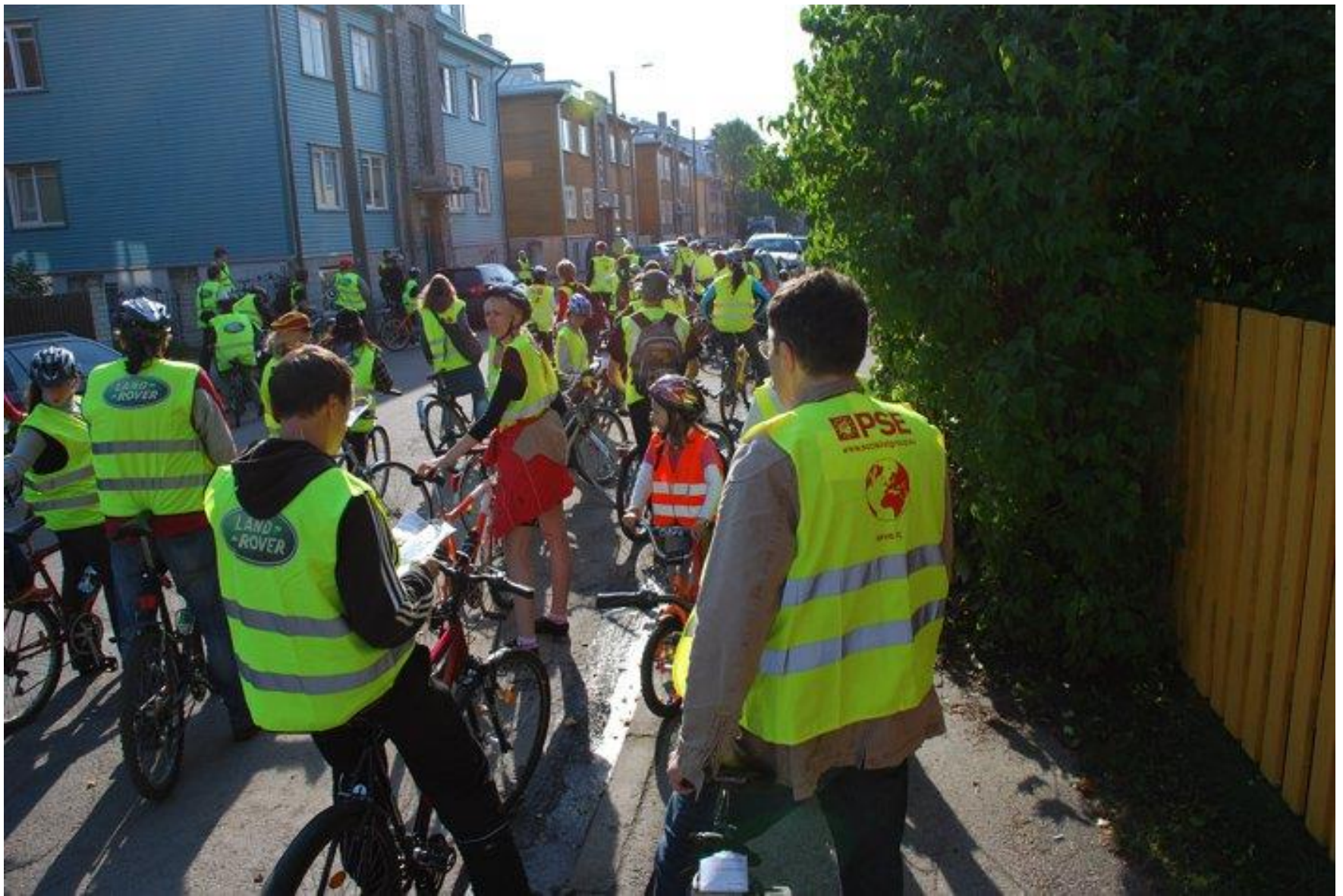
Bike tour on neighbourhood history in Kalamaja - 2011