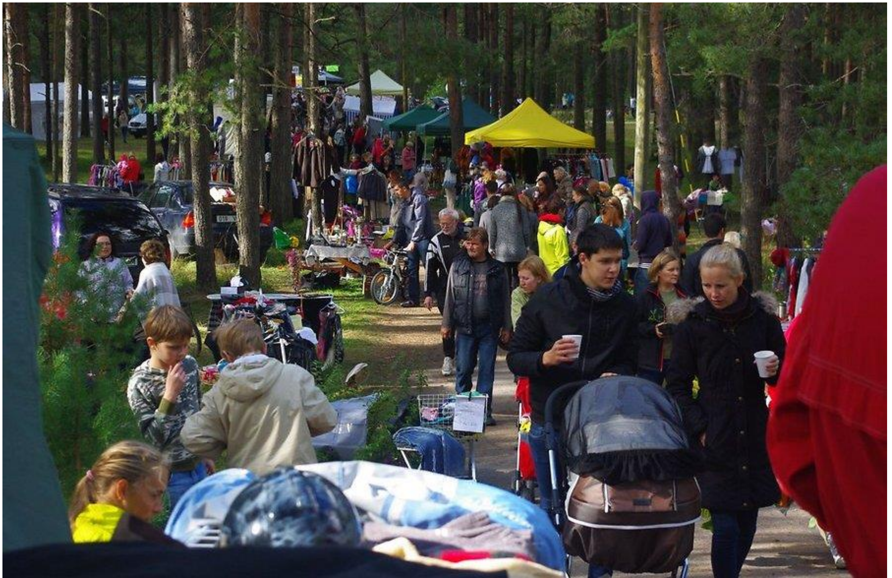
Green gates' street festival in Nõmme - May 2013