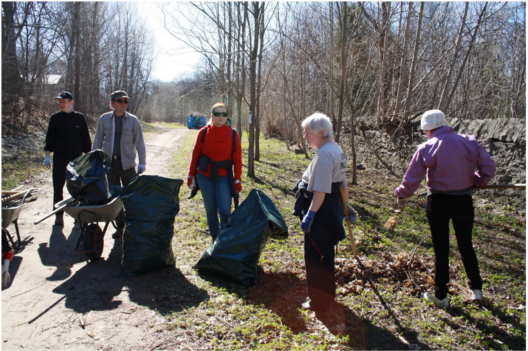
Cleaning action in Juhkentali as part of the national „hysteria“ - May 2013