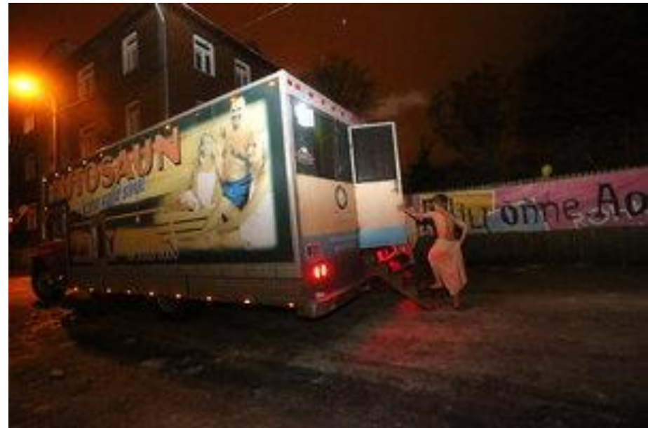
Celebrating Ao street's jubilee with street party and sauna van in February 2013