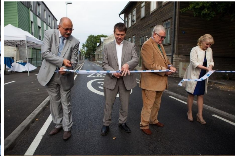
Around 500 residents opening the new pedestrian lane of Soo street in September 2013