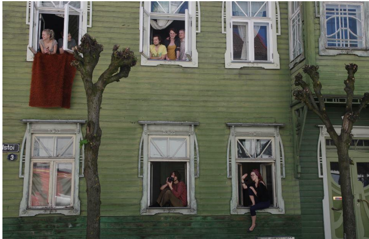
Neighbourhood watch in milieu districts

4. Active neighbourhoods are the local experts! Living locally creates better opportunities for cherishing relationships and sustaining enjoyable living environments.