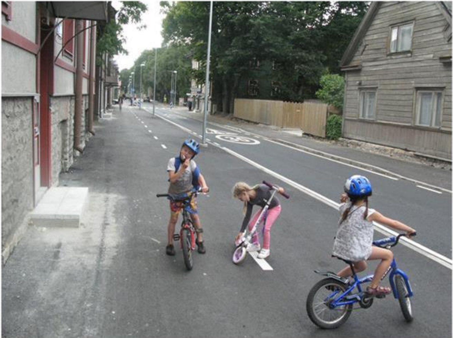
Soo street after: pedestrian friendly public space thanks to community involvement