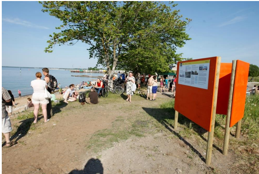
Kalarand beach installations in central Tallinn wasteland where major developments are planned

3. Active neighbourhoods show alternative ways of using space, give places new meanings and function. The more lively the neighbourhoods are, the more attractive they are for newcomers, tourists, developers, etc.