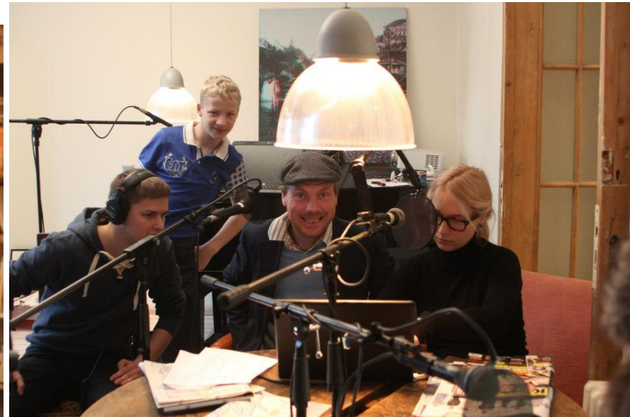
Self-initiated library and community radio in Uus Maailm district